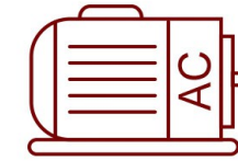
Three phase 400 VAC motor