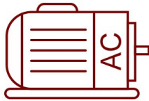
Three phase 230 VAC motor